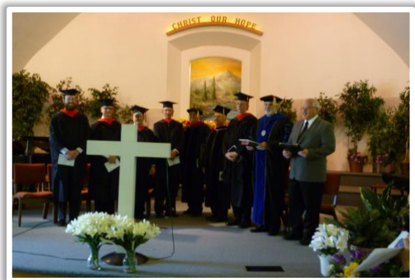
Some of the RMBC Faculty